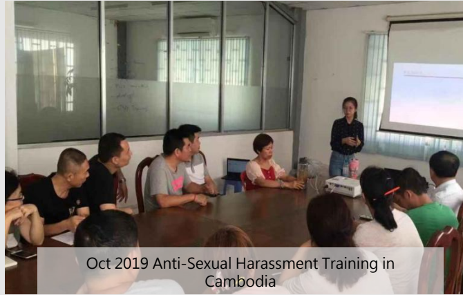
Oct 2019 Anti-Sexual Harassment Training in Cambodia