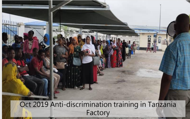
Oct 2019 Anti-discrimination training in Tanzania Factory