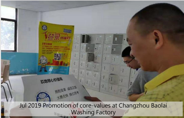
Jul 2019 Promotion of core-values at Changzhou Baolai Washing Factory