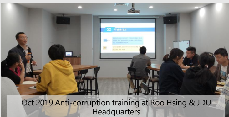
Oct 2019 Anti-corruption training at Roo Hsing & JDU Headquarters